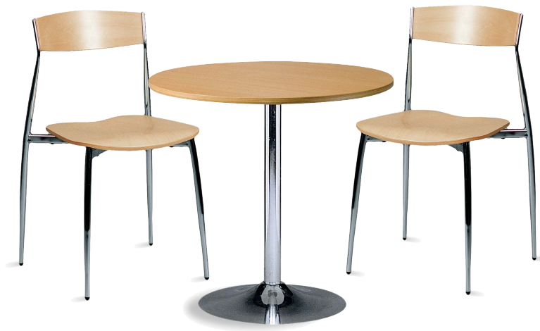
Conference table and chairs