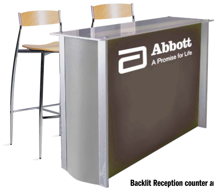
Backlit Reception counter and bistro chairs